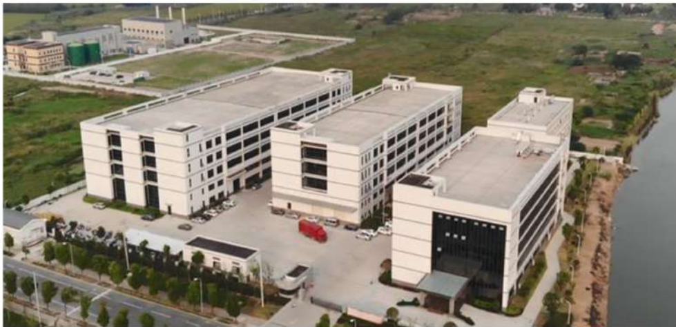
Shanghai Hengyi Mechanical&Electrical Engineering Co., Ltd.

We constantly strive to provide each customer with better products along with customized services. We are committed to become the most professional and efficient manufacturer in the field of EV charging. Now our products adapt to vast majority of vehical models around the world and we will continuously update to provide with safe and efficient EV charging products.