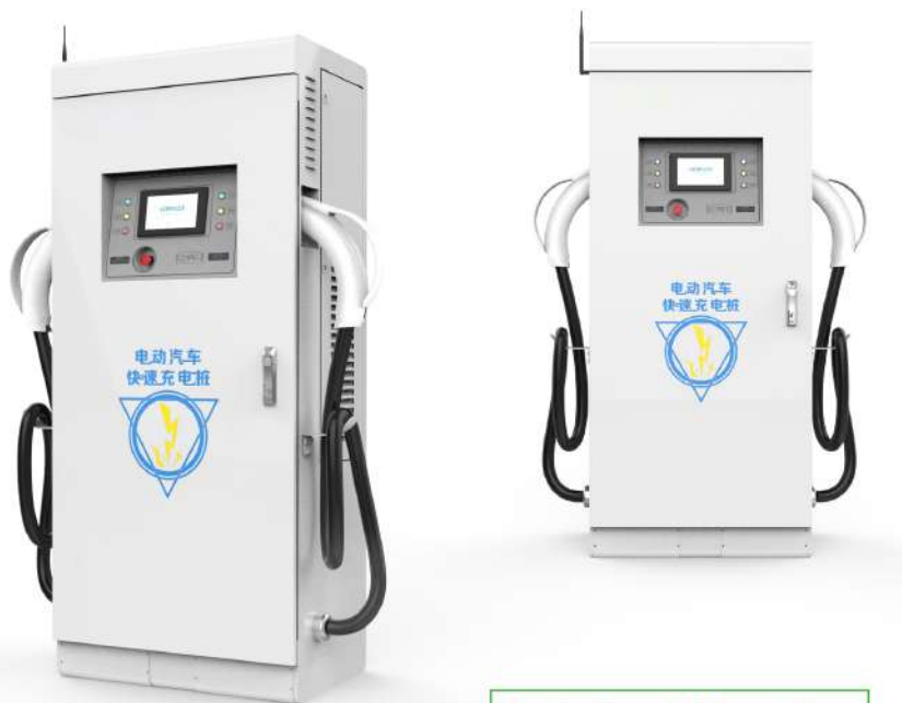
Product model description

The power switching and configuration of DC station follow the principle of modular design, which can be flexibly configured into 90KW, 120KW or 150KW power output, and the maximum output power of a single plug can reach 150KW, meeting the charging requirements of different vehicles and different operating scenarios. The product covers single and double plug output, and is a reliable choice for outdoor fast DC charging.